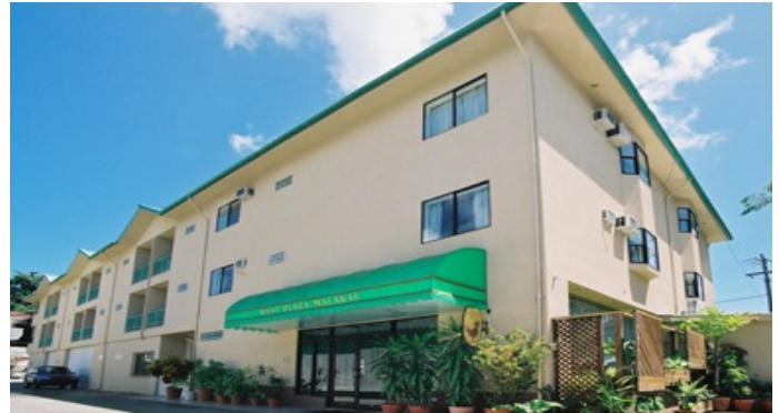
West Plaza Malakal